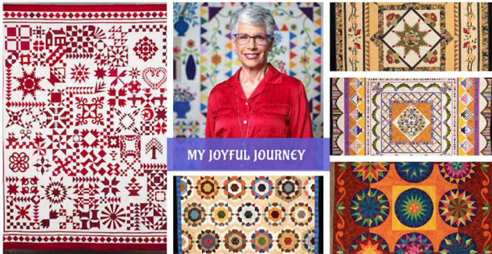
MY JOYFUL JOURNEY: My life as a Quiltmaker and a Quilt Teacher. All things "QUILT"!

$5.00 Handout Fee required. https://bbquiltmaker.blogspot.com